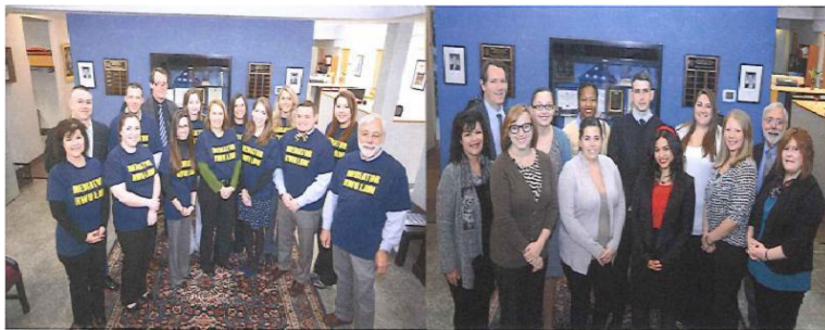
2013 Spring & Fall Divorce Mediation Clinics with Roger Williams Law School and Rhode Island Bar Association Volunteer Attorneys

In an ongoing partnership between the Bar Association's Pro Bono programs and Roger Williams University School of Law's Mediation Clinic, a family law mediation clinic was held this past November, successfully providing pro bono aid to many low income couples who had nowhere else to turn for legal assistance. All couples that participated were then placed with a volunteer attorney to complete the court process. This cooperative effort is held on a Saturday and is an effective and efficient method twice a year of serving our low income clients who are interested in mediating their case. A spring clinic is tentatively planned for March 29, 2014.